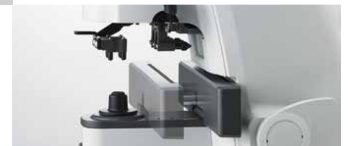
Minimize the Distance between PD Bar and Lens Support