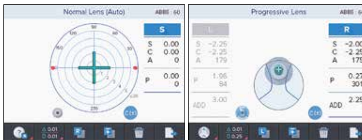
Auto Lens Recognition

Able to measure small-sized progressive multifocal and bifocal lens as well as exquisitely measuring the power of near position.