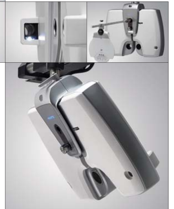
Tiltable Refractor Body

Customized exam is available for those who have different monocular heights within adjustment +/- 3mm.