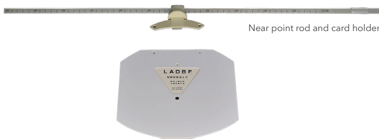
Near point rod and card holder